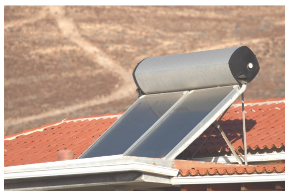
Estructura de superficie plana para dos captadores con depósito, fabricada en aluminio.