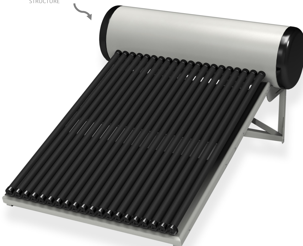
SOLAR COLLECTOR WITH ITS STRUCTURE

El Labelling, packaging and manuals can be personalised with the client's brand logo.