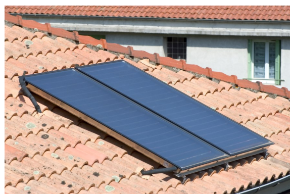
Estructura coplanar de superficie inclinada, fabricada en aluminio y fijaciones salva-teja de acero inoxidable.